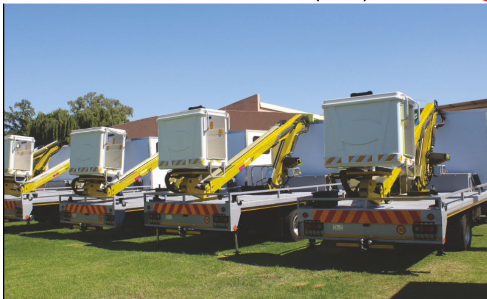
WORKING FLIGHT ENVELOPE

Designed and manufactured in South Africa